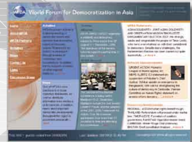
World Forum for Democratization in Asia website http://www.wfda.net/