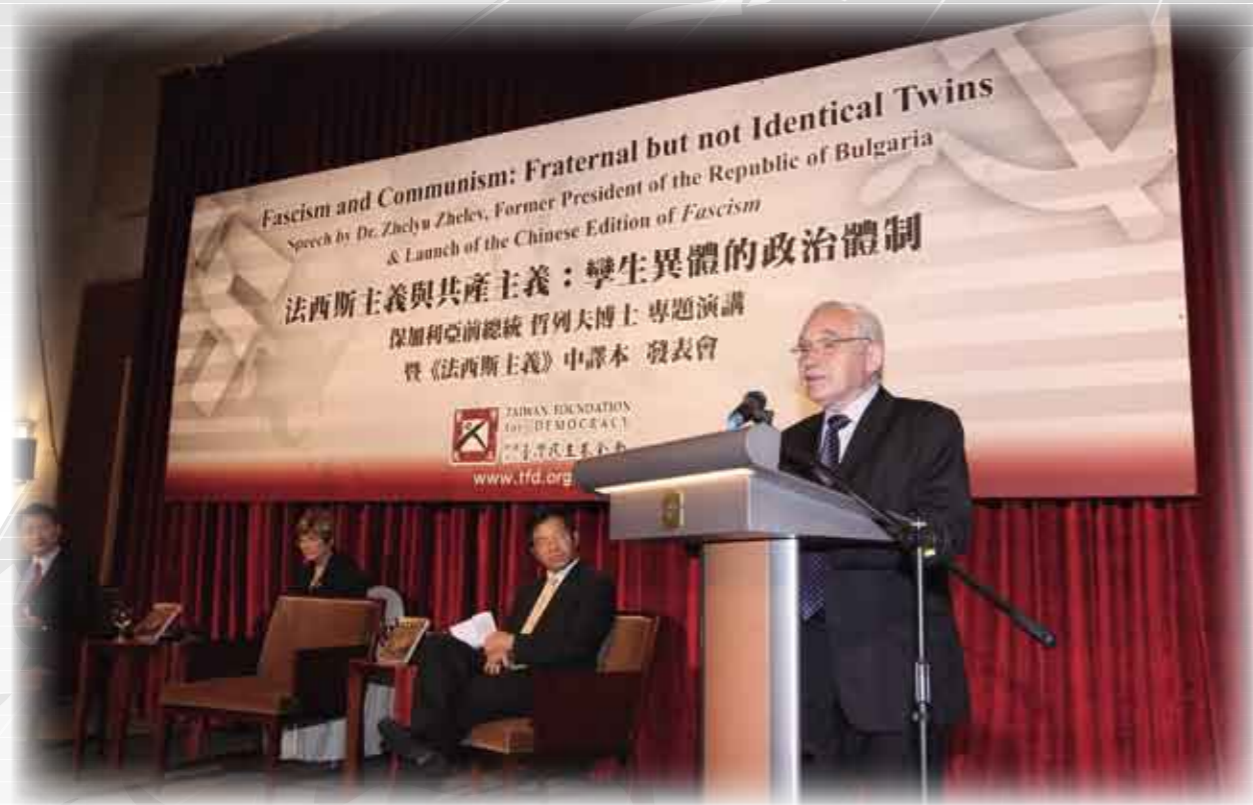
July 2007: Lecture by Dr. Zhelyu Mitev Zhelev, former president of Bulgaria

(3) Dr. Zhelyu Mitev Zhelev , former president of the Republic of Bulgaria, was invited by the TFD to Taiwan to launch the Chinese edition of Fascism , Dr. Zhelev's seminal work. At the launch event on 25 July, Dr. Zhelev delivered a keynote speech, "Fascism and Communism: Fraternal but not Identical Twins."