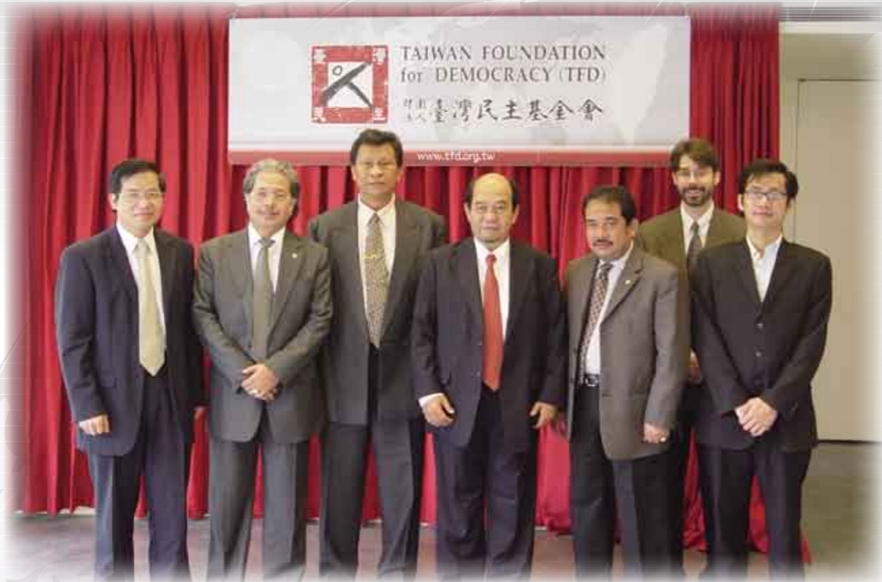
April 2007: Visit of Parliamentary Delegation from Indonesia