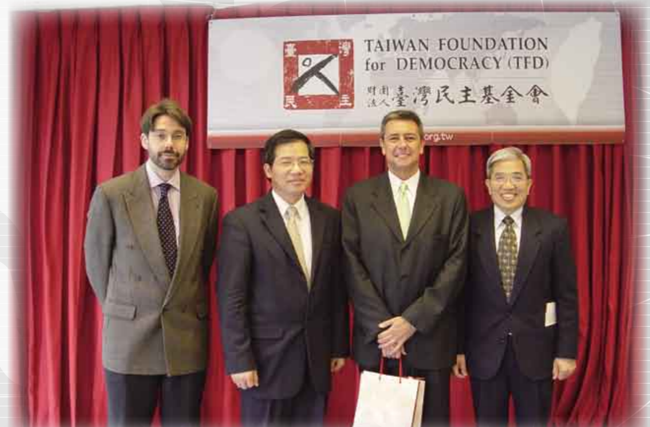
April 2007: Visit of Hon. Jaime Salinas, chairman of the National Justice Party of Peru