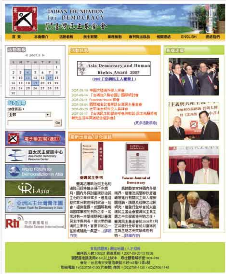
Taiwan Foundation for Democracy website http://www.tfd.org.tw/