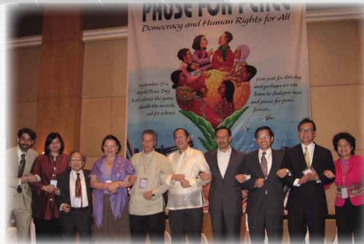
September 2007: Second WFDA Biennial Conference

The Biennial received significant international attention. Former Deputy Prime Minister of Malaysia Anwar Ibrahim gave the keynote speech at the conference, and a number of important figures in the Philippines attended the conference as well – Secretary Jesus Dureza, Presidential Advisor on the Peace Process, delivered welcome remarks at the opening ceremony, and Senator Benigno Aquino, III spoke at the closing ceremony. The conference’s activities included an interfaith prayer for peace and democracy on 21 September, the International Day of Peace, led by Buddhist, Christian, Muslim, and Hindu religious leaders from a variety of Asian countries.