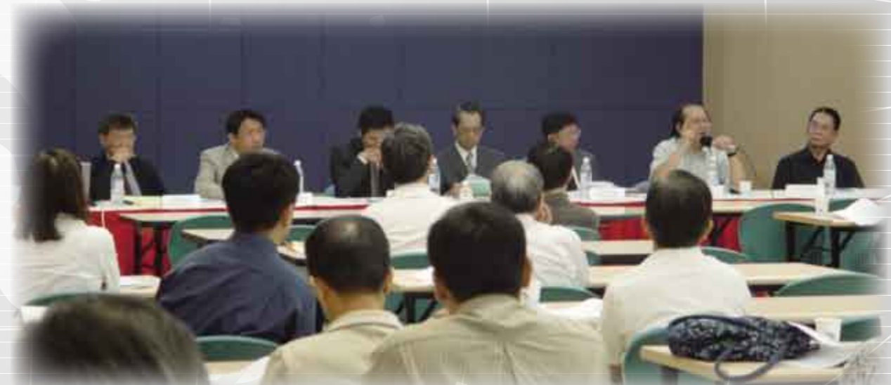
July 2007: Symposium on the 20th anniversary of the lifting of martial law