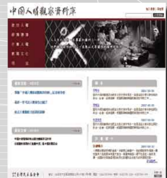
China Human Rights Database http://www.chrod.org.tw/