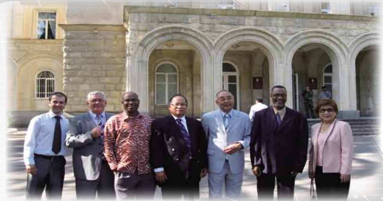
May 2007: Unrepresented Nations and Peoples Organization presidency meeting in Abkhazia