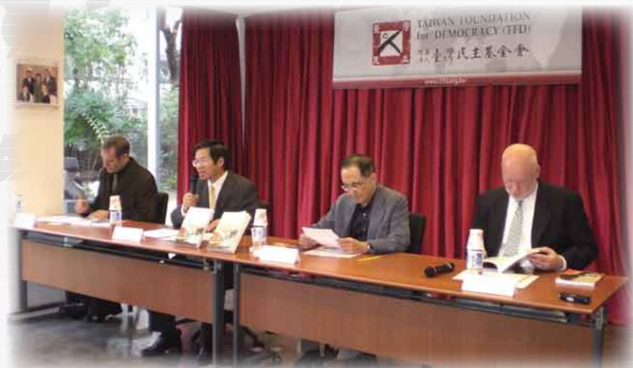
November 2007: Launch of the Chinese Version of the Guidebook to Direct Democracy

The TFD invited the IRI-Asia International Steering Committee (ISC), consisting of members from Bangladesh, Thailand, Korea, Japan, India, and the Philippines, as well as observers from Palau, Timor Leste, and Switzerland, to attend the ISC meeting. ISC members discussed the state of direct democracy in Asia, IRI-Asia's participation in the 2008 World Conference on Direct Democracy, and the future establishment of IRI-Asia. Before the meeting, the TFD hosted a press conference to announce the launch of the Chinese version of the Guidebook to Direct Democracy: In Switzerland and Beyond – 2007 Edition . In order to help the Chinese-speaking community understand issues of direct democracy, the TFD was authorized by the Swiss government and IRI-Europe to translate and publish the first Chinese edition of the Guidebook to Direct Democracy series.