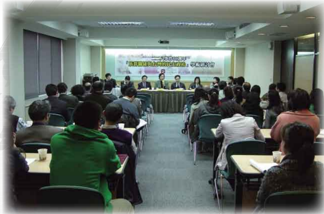
February 2007: Symposium “Ethnic Relations and Taiwan’s Democratic Politics”