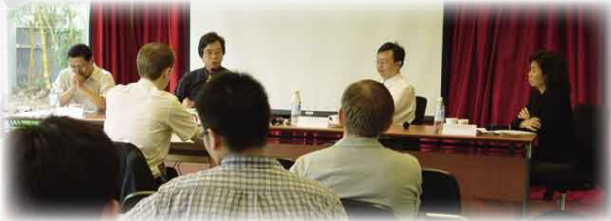
October 2007: Seminar on the human rights situation in Burma