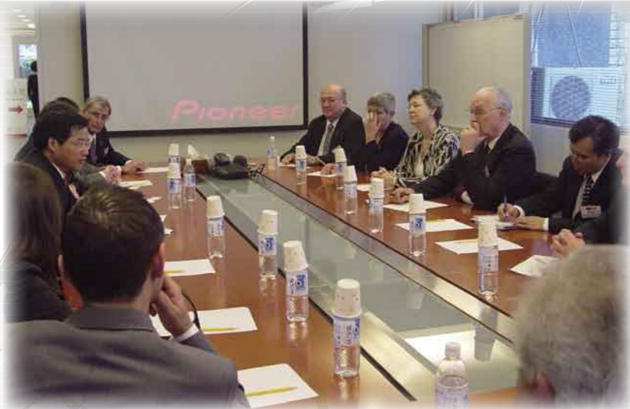
January 2007: Visit of Parliamentary Delegation from Canada