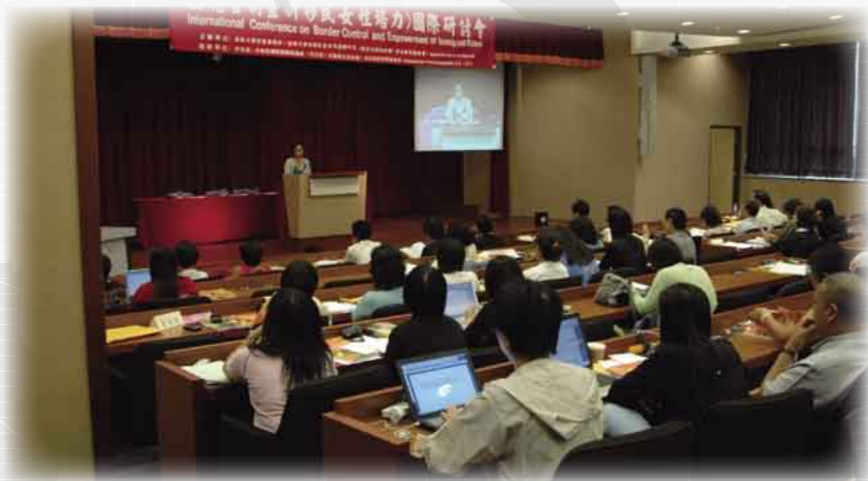
September 2007: “Border Controls and Empowering New Immigrant Women” conference