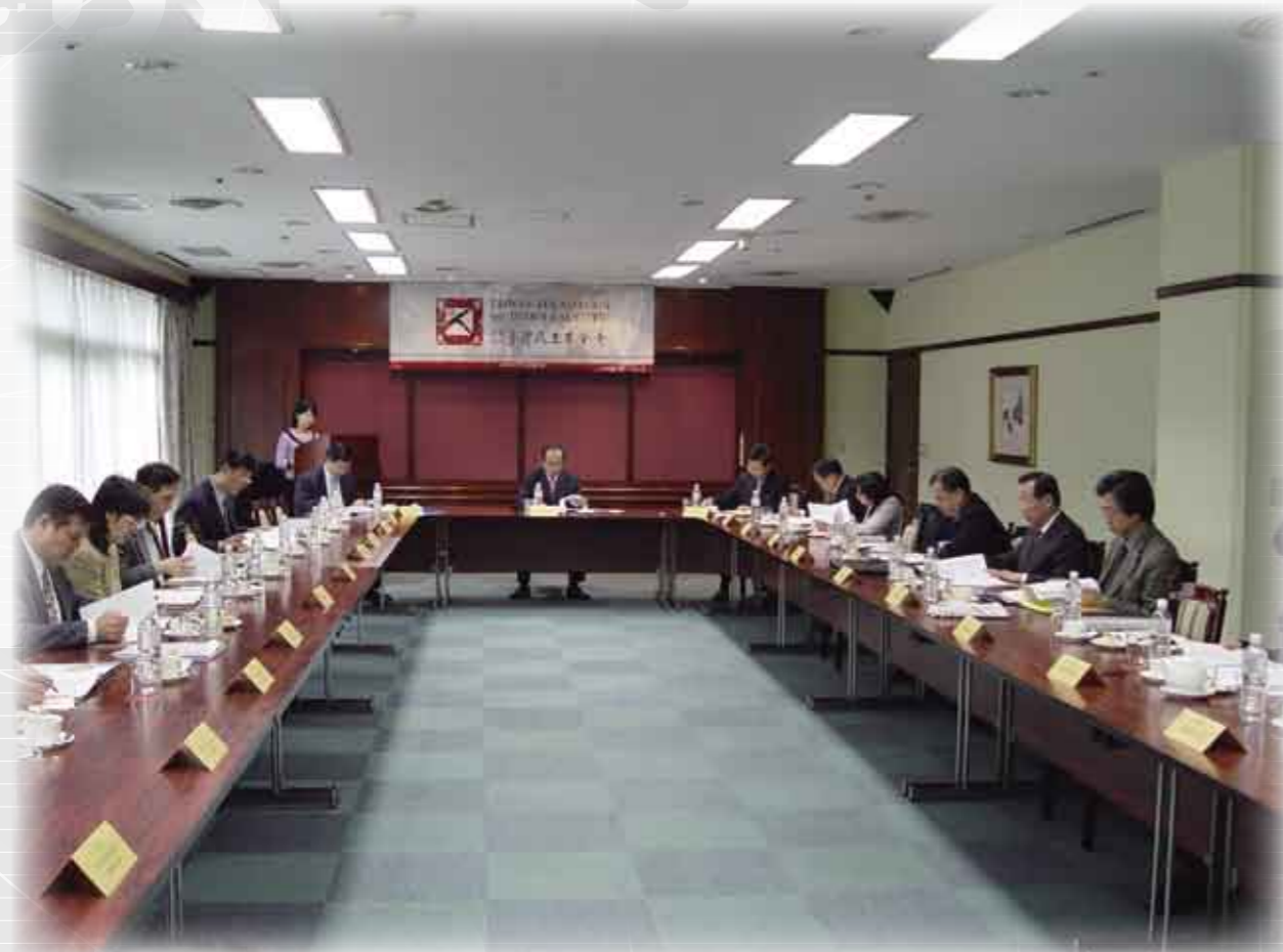
April 2007: Third joint session of the second-term Boards of Trustees and Supervisors

The remaining portion of the operating budget is allocated for grants to domestic and international organizations to support their democracy and human rights activities, as well as the TFD's own programs of bilateral and multilateral cooperation, research, conferences and public forums, and publications.