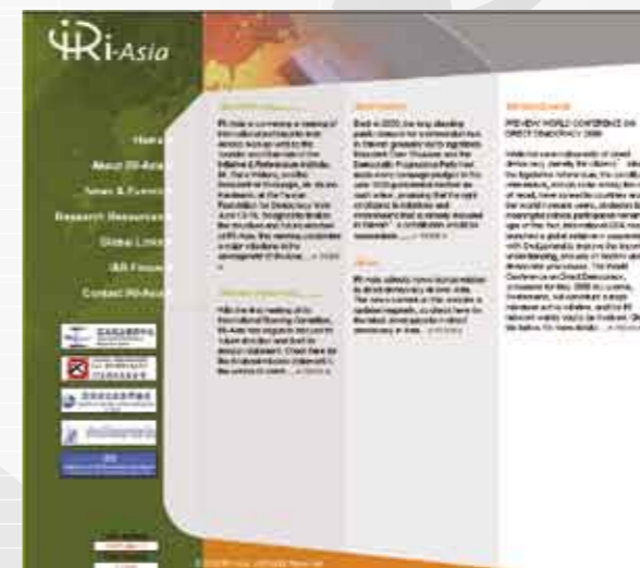
Initiative & Referendum Institute - Asia website http://www.iri-asia.net/