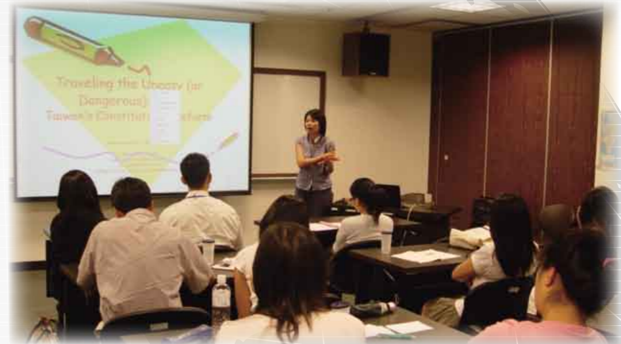
July 2007: Briefing for participants in the “2007 Taiwan Tech Trek”