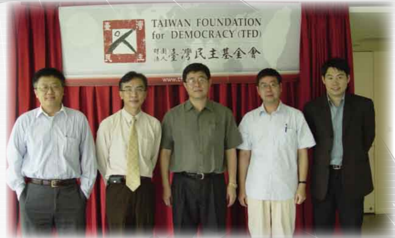
June 2007: Visit of delegation of Chinese scholars