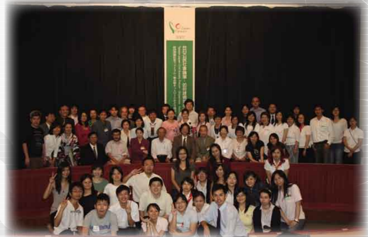
June 2007: "2007 Taiwan-Japan Civic Forum"