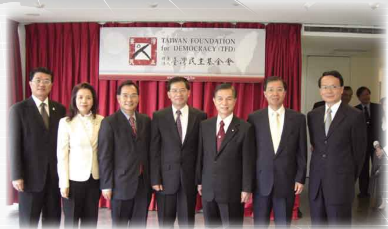
November 2007: Visit of members of the Foreign Affairs Committee of the Legislative Yuan