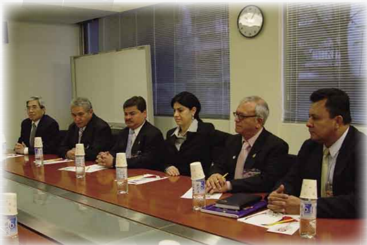
February 2007: Visit of Hon. Mary Elizabeth Flores Flake, First Deputy Speaker of Congress of Honduras