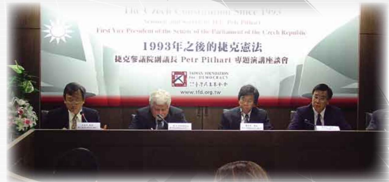
October 2007: Speech by Hon. Petr Pithart, First Vice President of the Czech Senate

(6) Hon. Petr Pithart , First Vice President of the Senate of the Parliament of the Czech Republic, was invited to deliver a keynote speech in the seminar, "The Czech Constitution since 1993," on 15 October, exchanging the experience of constitutional reform in new democracies.