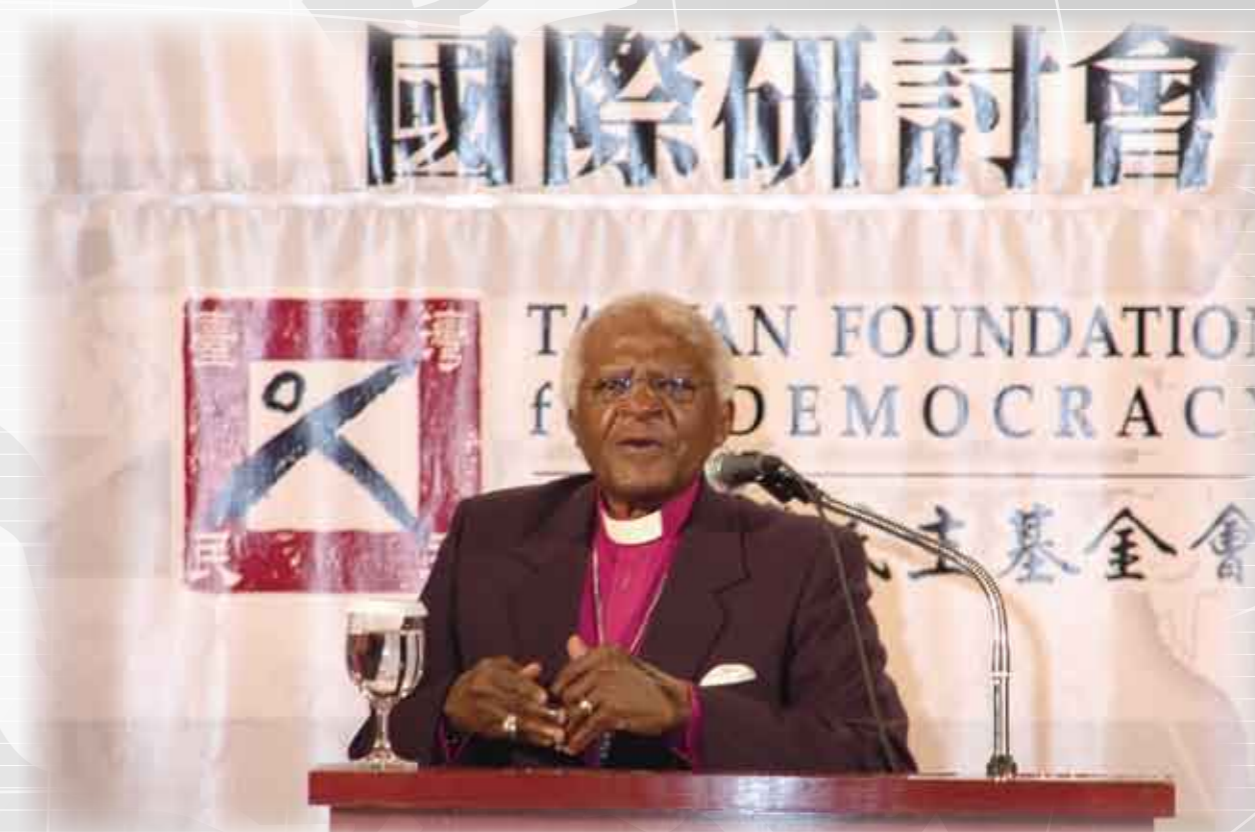
April 2007: Keynote Speech of Archbishop Desmond Tutu