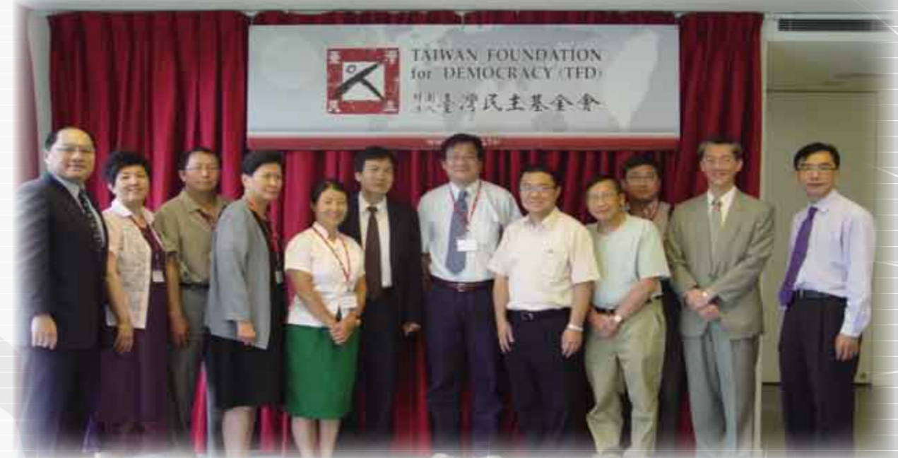
July 2007: Visit of the Association of Chinese Professors of Social Sciences in the US