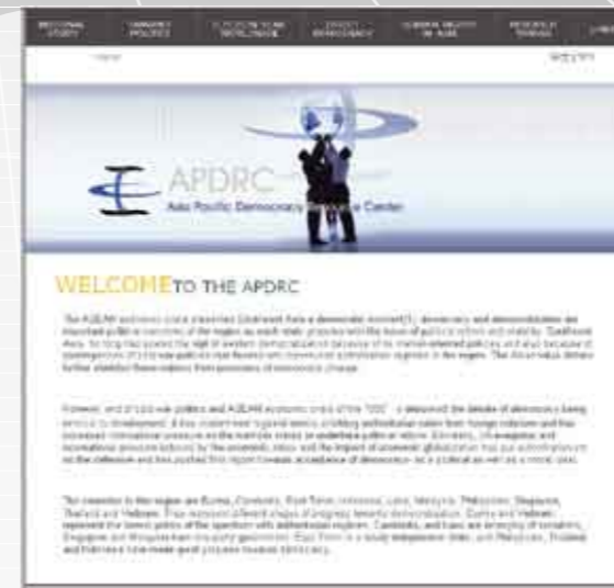
Asia Pacific Democracy Resource Center website http://www.apdrc.org.tw/