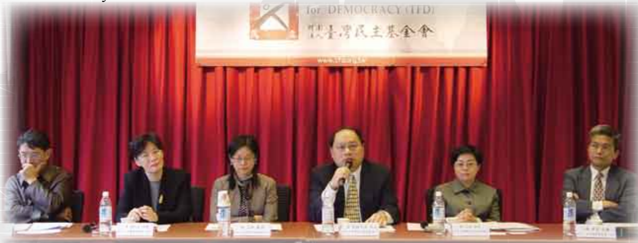
December 2007: Seminar "New Election System, New Legislature"