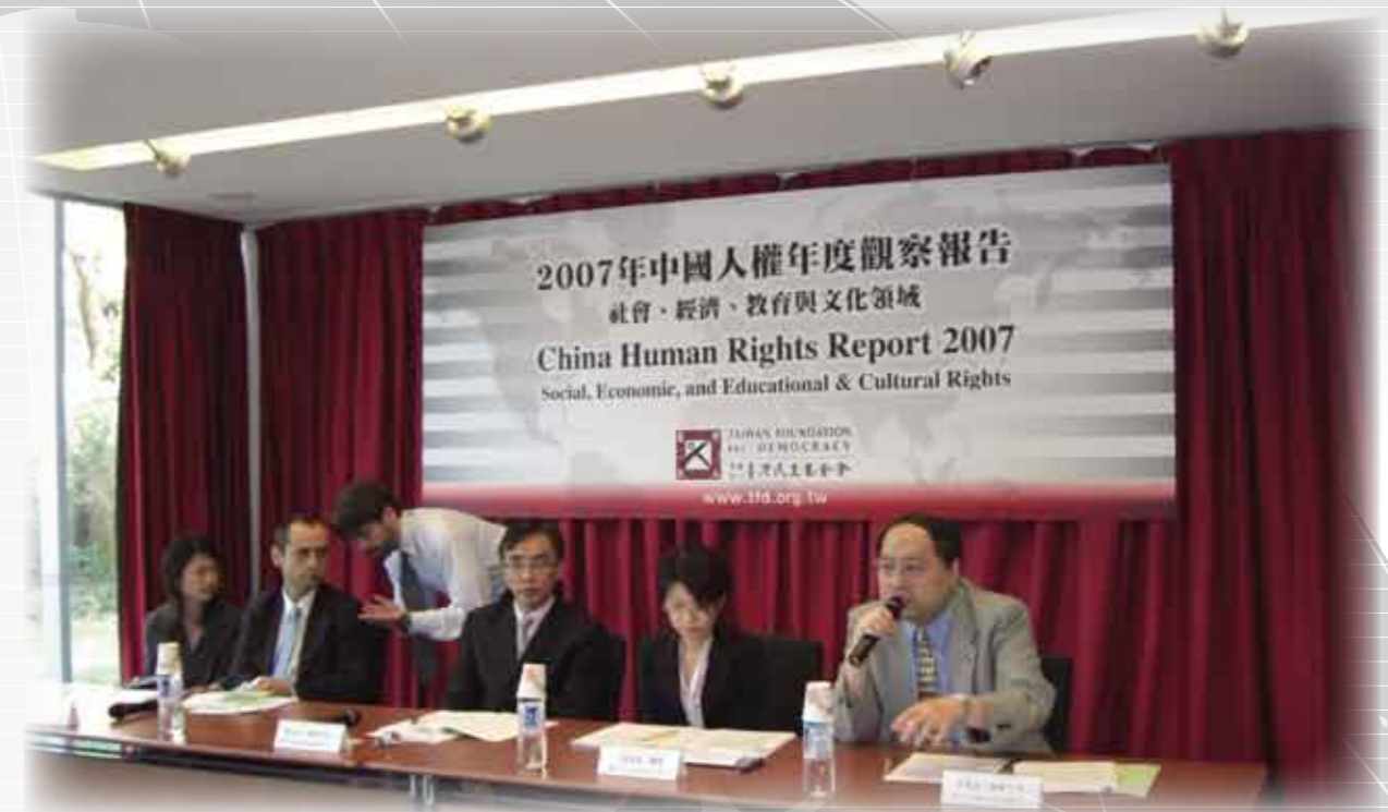
December 2007: Release of the China Human Rights Report 2007