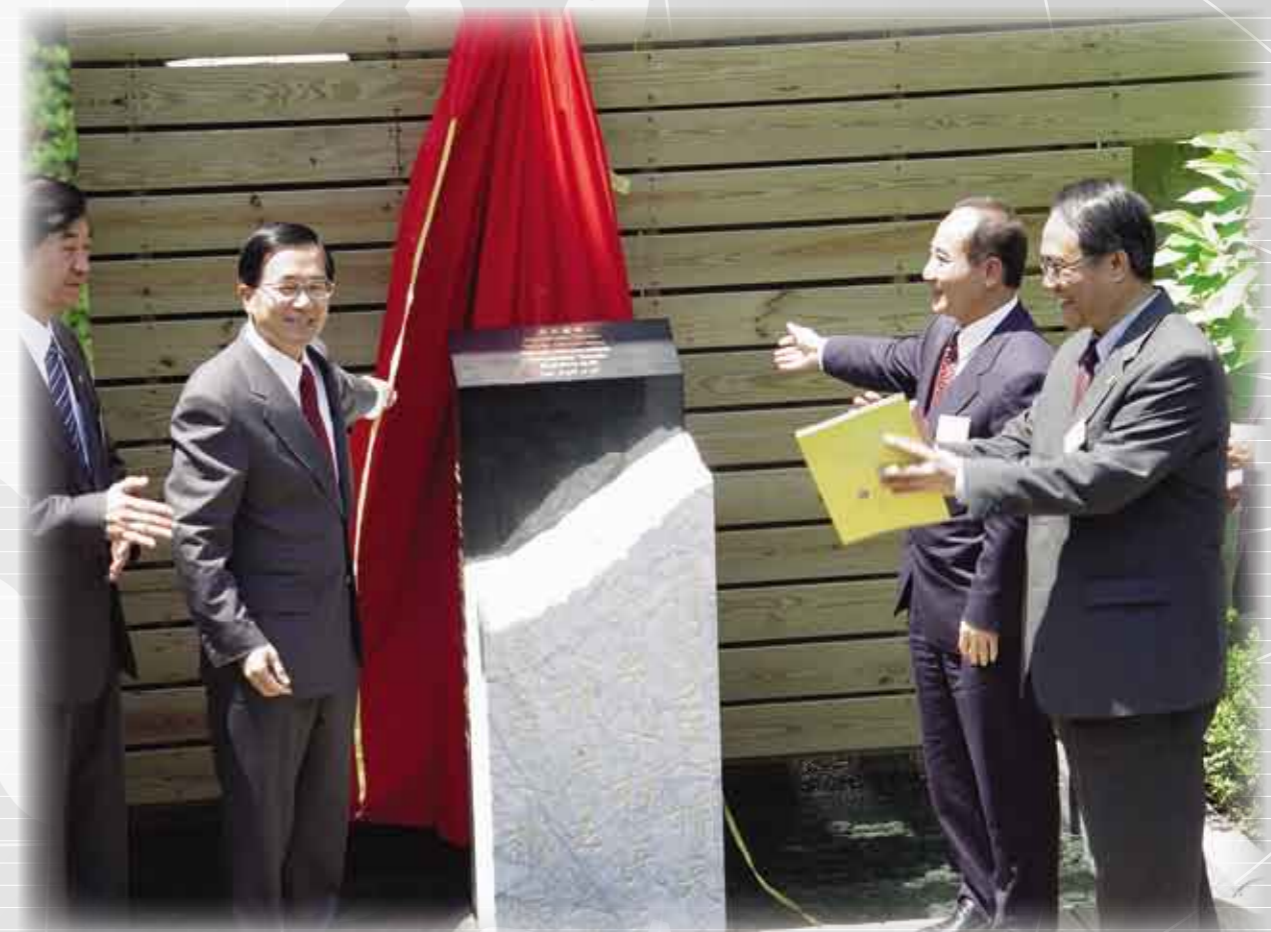
June 2004: President Chen hosting the dedication ceremony