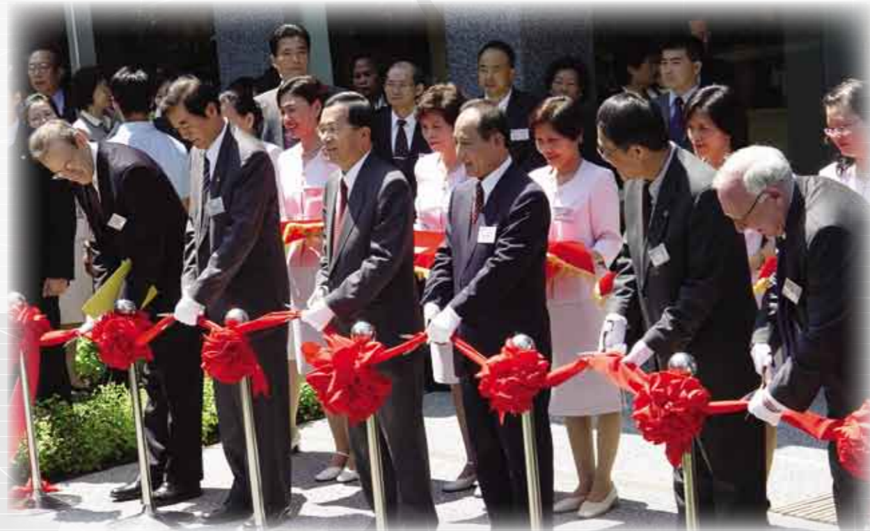
June 2004: President Chen hosting the dedication of the new TFD office

The TFD is the first national democracy assistance foundation in Asia. Its purpose is to be a nonprofit, nonpartisan, permanent, transparent, publicly funded institution for democracy and human rights. Bringing together the strengths of political parties, civil organizations, and the people, and promoting cooperation with related groups, political parties, intellectuals, academics, and nongovernmental organizations, the TFD can connect with international democratic forces to enlarge Taiwan's international space.