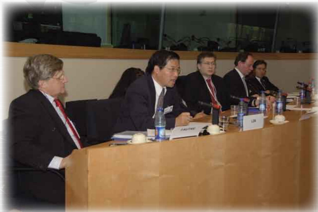
December 2007: “Human Rights In China: No Olympic Medal”

China Democracy and Human Rights Programs