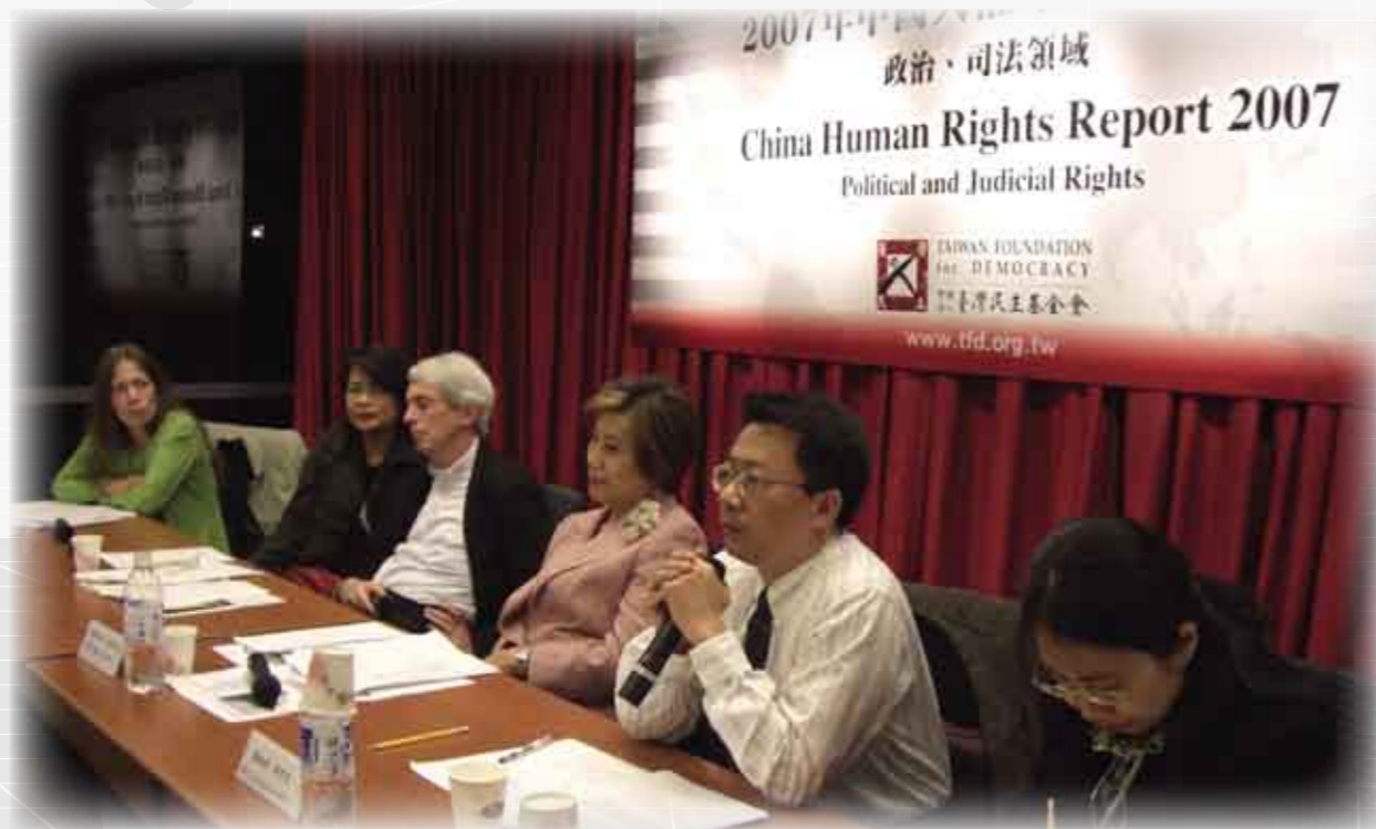
December 2007: Release of the China Human Rights Report 2007