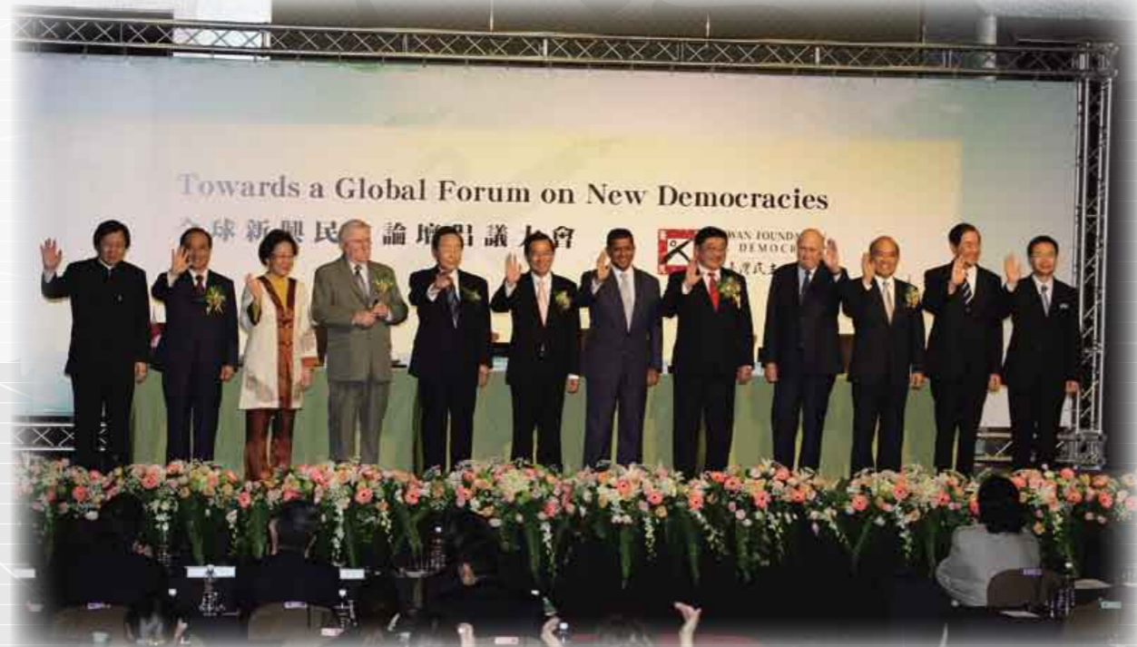
January 2007: International Conference "Towards a Global Forum on New Democracies"